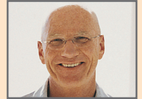
Larry started saving $300 a month at age 45. After 20 years he saved $136,694.