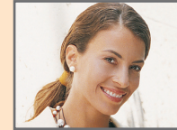
Susan started saving $100 a month at age 25. After 40 years she saved $191,696.

With more time to grow, Susan contributes less... but ends up with more.